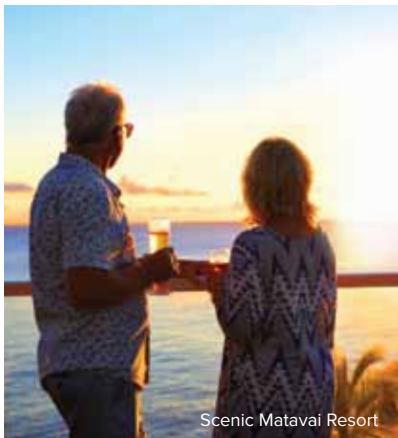
Scenic Matavai Resort

Visitors are able to get married in Niue, for more information contact the Matavai Conference Centre or the Niue Visitor Information Centre.