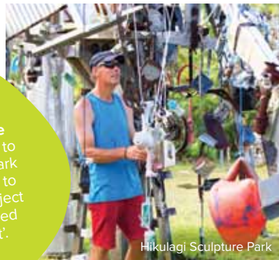
Hikulagi Sculpture Park

Hikulagi Sculpture Park invites visitors to leave their small mark on Niue by adding to the large, found object assemblage entitled 'Protean Habitat'.